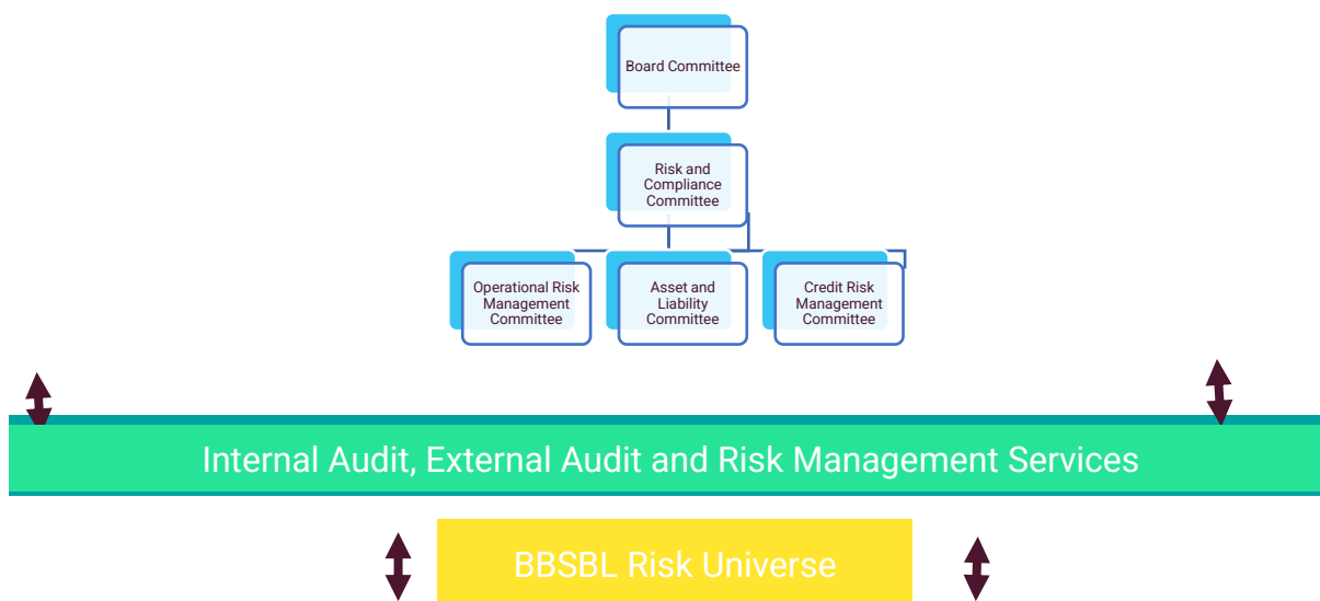
Table 1 – BBS Bank Risk Universe and assigned Risk Owners

The following chart represents the bank risk universe: